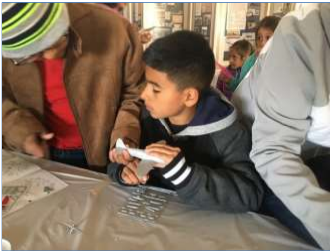
This young man is getting some assistance from his brother on his Republic P-47D Thunderbolt.