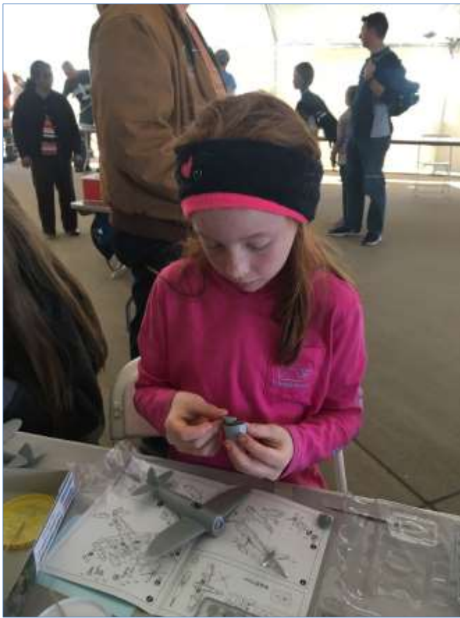
Test-fitting the engine in the cowling was aided by tabs. 2017 © Frank Landrus