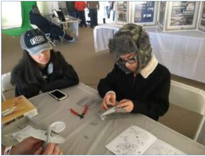
This young man is decively assembling his Thunderbolt as his mom looks on. Although his hat may be stylish, it surved its purpose. The last weekend in October in Fort Worth was cold until mid-afternoon.

The pluses of both shows is that we introduced a significant number of children and their parents to modeling. We did have some kids that have built kits before, but the vast majority were first timers.