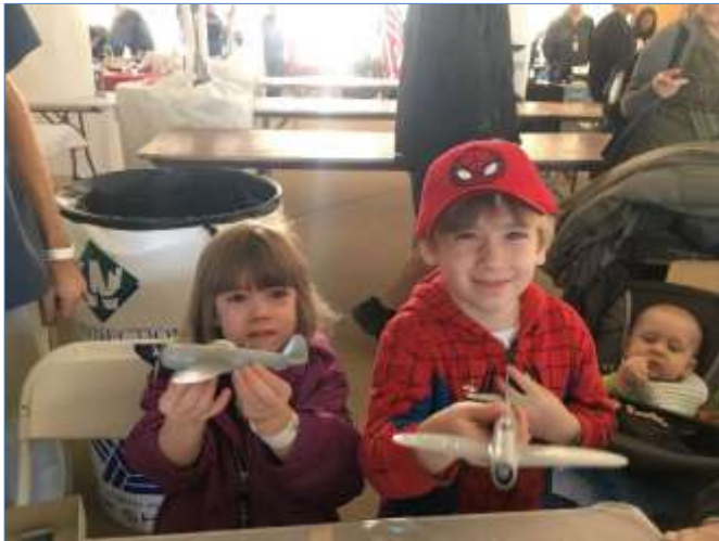
The young lady above with her seven year old brother showing off their completed Republic P-47D Thunderbolts with their parents and little sister watching. 2017 © Frank Landrus

We discovered early on that the non-toxic glues, notably the 'blue' tube glue works very poorly on plastic models. The last thing you want to do when introducing kids to modeling is to make it frustrating, and we found out quickly that a glue that does not work will not endear a child to pursue modeling.