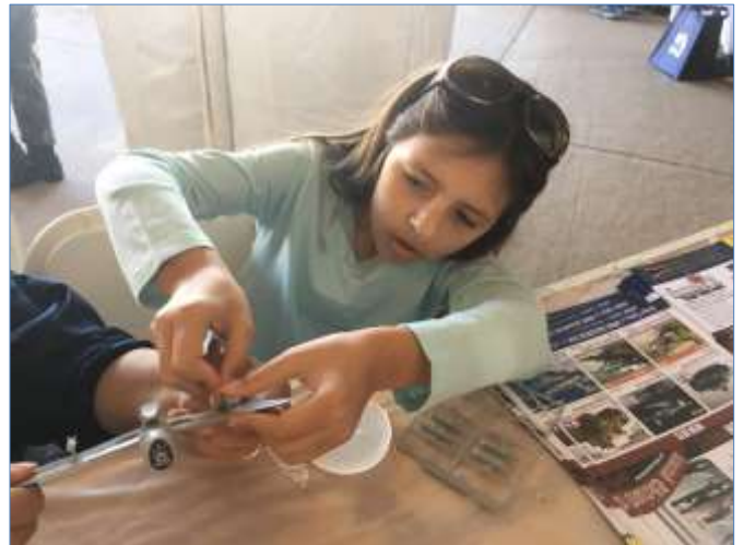
This young lady is taking advantage of a biological jig to assure proper placement of the wing bomb / pylon assembly on her Republic P-47D Thunderbolt. Under her elbow, you can see the special flyers Squadron prepared with their own discount code for the Alliance Airshow.