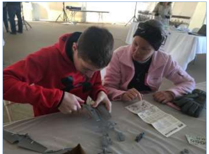
This young man wanted a more challenging kit and grabbed a Monogram 1/48 P-51D Mustang. As you can see his mother is keenly paying attention. One of our requirements for Make-N-Take is at least one parent be at the table so modeling can be a 'family event'..

Museum, who put us in touch with a representative of the Alliance Airshow and were invited to participate in their STEM tent.