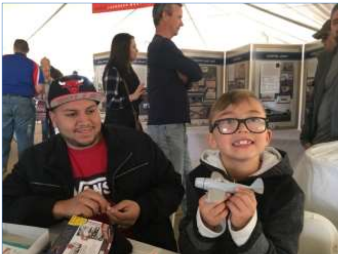
This proud dad looks on as his son shows off his Republic P-47D Thunderbolt 2017

The sad part was many kids walked away because their parents did not wait for an open spot, and they did not come back later. That being said, our volunteers were clearly maxed out trying to support the multiple builds going on at any given time. The only real break we got was when the Blue Angels went airborne at 4 pm and nearly everyone went to see their exciting performance.