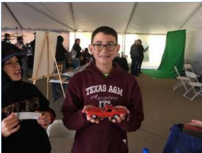
This future collegian built one of our last 1/25 Revell Snap-Tite 1963 Corvette Sting Ray Coupes. I would note that the Hobby Boss Thunderbolts fit significantly better. 2017 © Frank Landrus