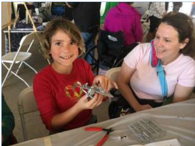
This young lady is waiting for the landing gear to dry.