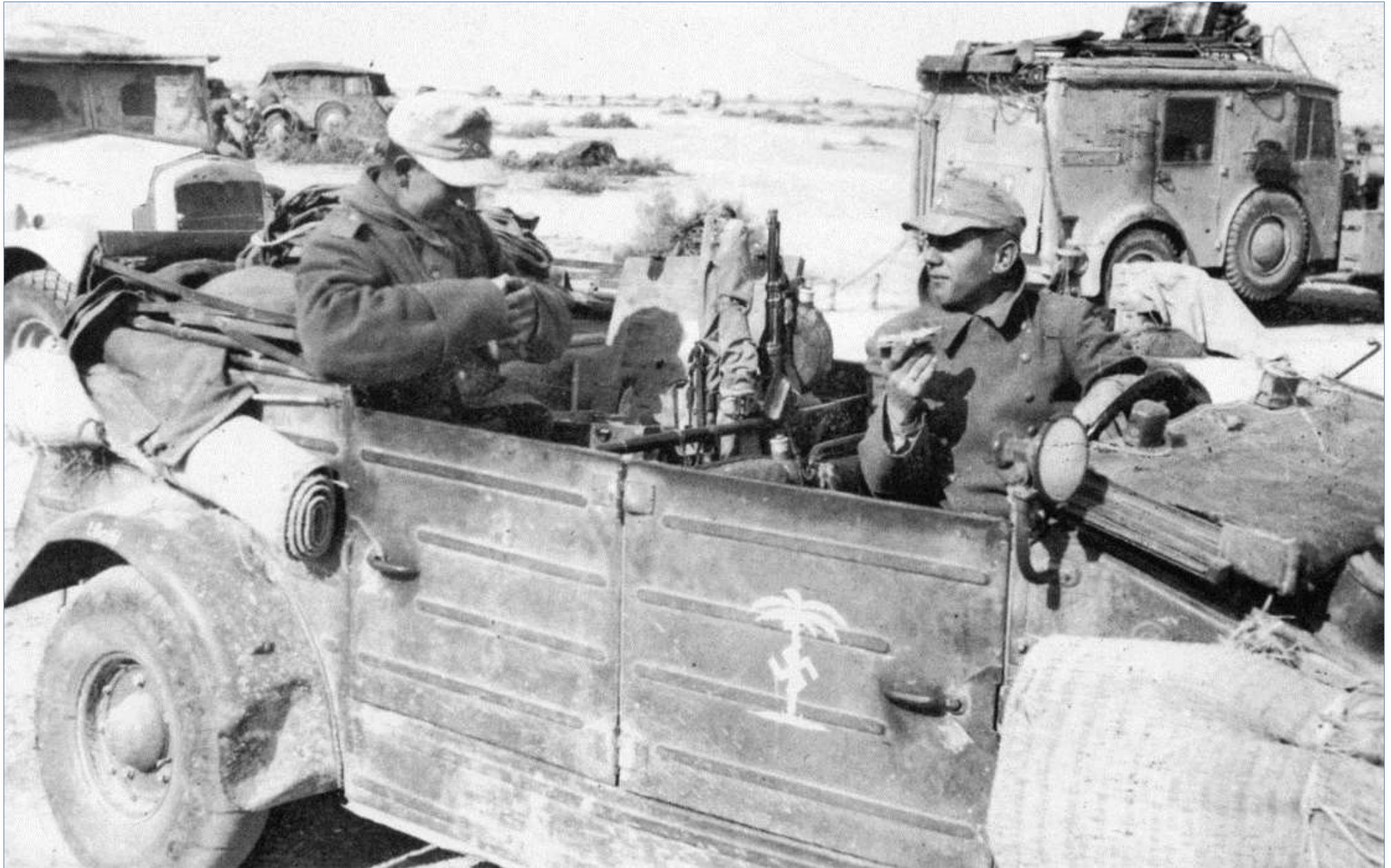
Soldiers eating rations in their Kubelwagon. Note the palm tree/swastika stencil on the door.