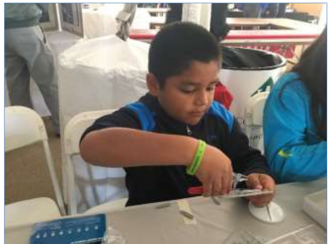
A young man trying to understand the proper technique for snipping parts from the sprue. 2017