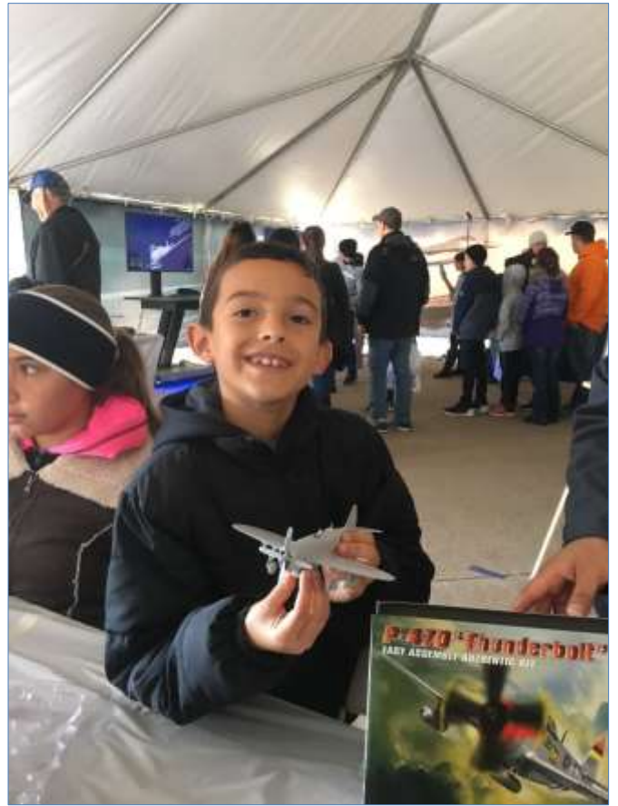
This young man is proudly showing off his Thunderbolt. 2017 © Frank Landrus

The big minus was we had to turn kids away because we simply did not have the space. We were limited to 20 chairs – which filled up all four tables.