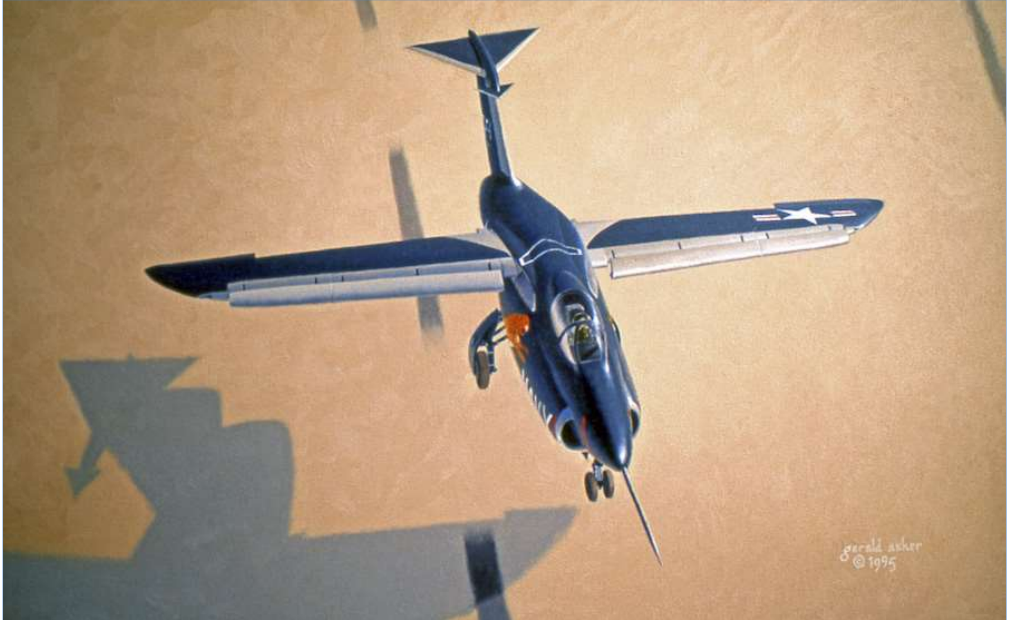
“One Fat, Lazy Cat”