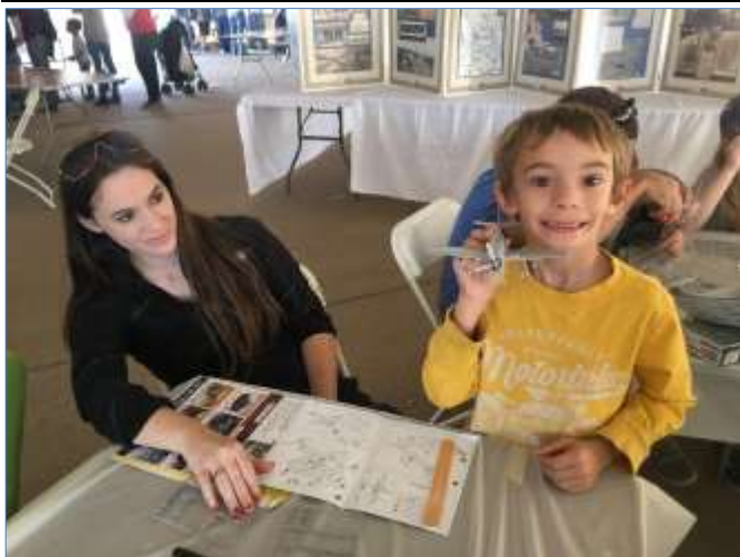
Its always entertaining to watch parents try to lean out of the picture when you are using a 14mm wide angle Nikon lens to take the picture.