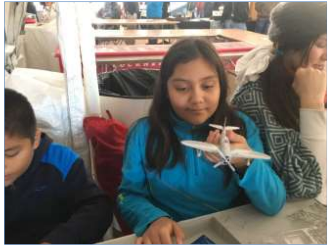
Another young lady checking out the flight lines of her nearly completed Republic P-47D Thunderbolt. These Hobby Boss kits and really good fit. 2017