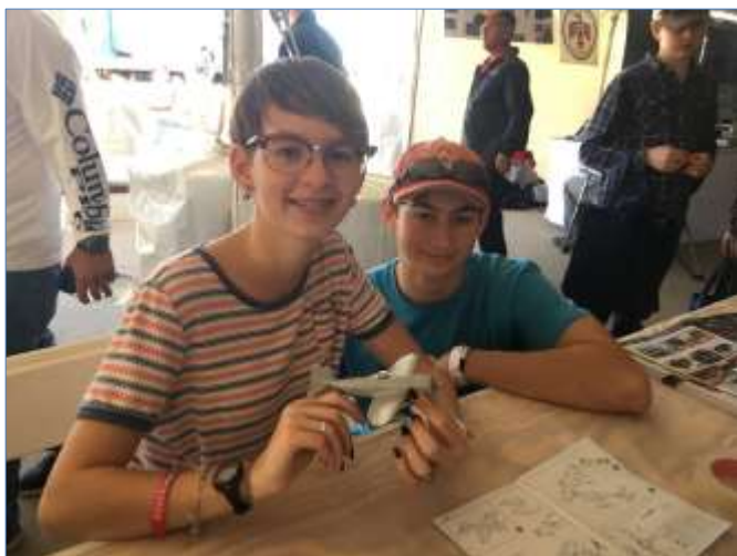
This older brother is introducing his 14 year old sister to the joys of modeling as she shows off her first completed model. The cold weather kept us from using the decals and all builders took their assembled model home to finish.