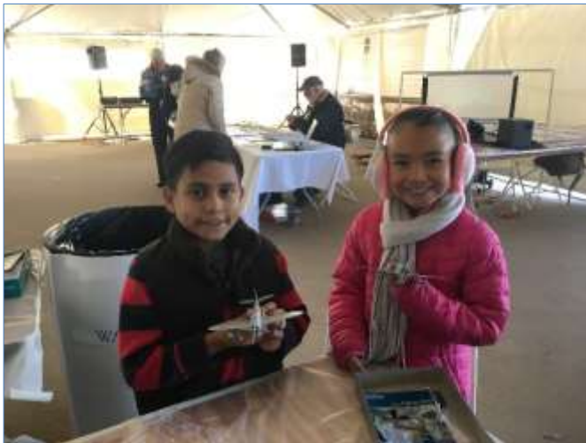
This brother and sister had a blast building their Hobby Boss 1/72 Republic P-47D Thunderbolts and proceeded to fly them around the airshow. 2017 © Frank Landrus