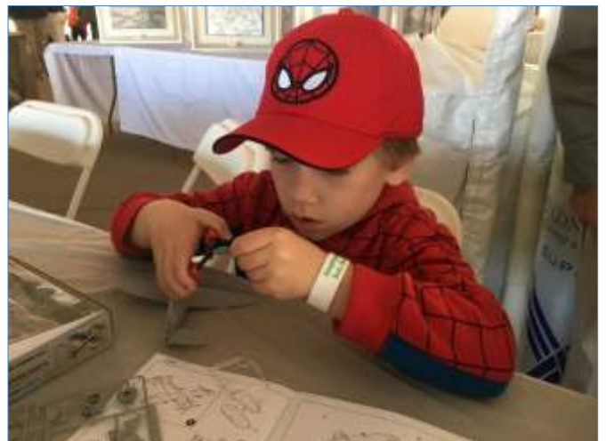
Even a seven-year old Spiderman can learn how to use side snips to remove parts from the sprue. 2017