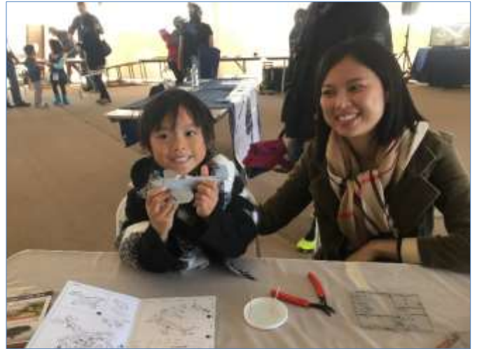
This young lady is proudly showing off her Thunderbolt. 2017 © Frank Landrus