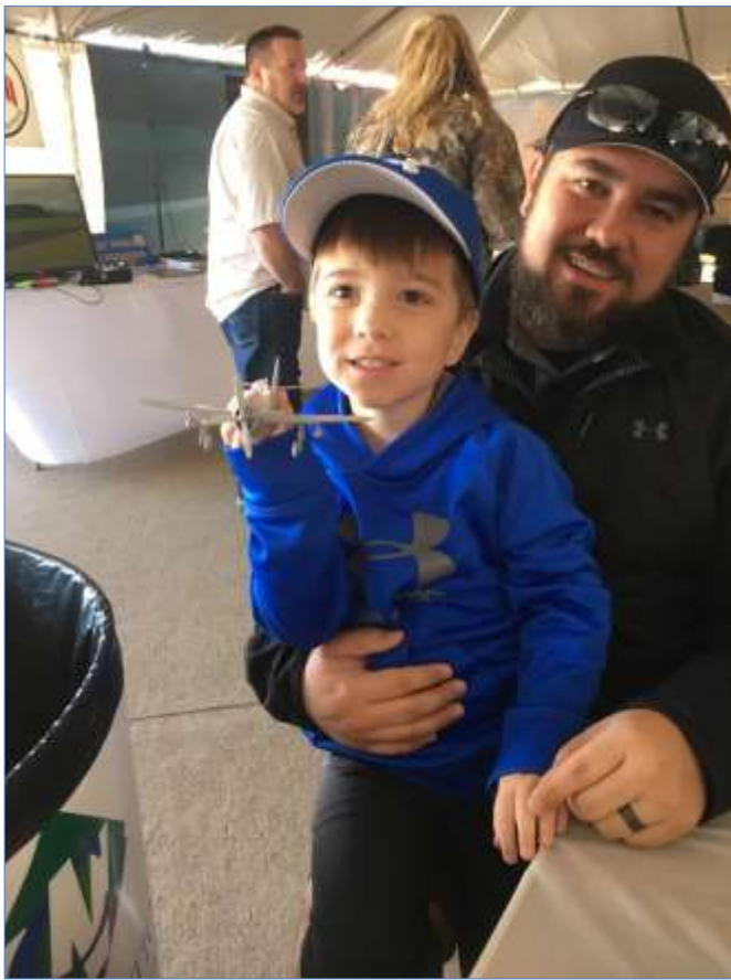
This proud dad looks on as his son shows off his completed Republic P-47D Thunderbolt.

While we normally limit the builders to less than age 16, it is really not too tough to accomplish that as few 16 year old children want to sit down with their parents for thirty to forty minutes (although it has happened on occasion). We really do not have a younger age limit, where the limitation is generally dexterity and attention-span. However, I have witnessed some three year olds (claimed anyways) assemble simple kits (the old Testors / Hawk kits from the late fifties).