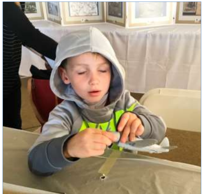
This young lady padwan is clearly utilizing the force to properly locate the cowling to the fuselage. 2017 © Frank Landrus