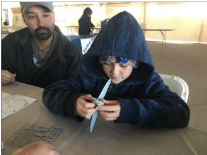
This father looks on as his son holds parts together waiting for the tube glue to dry.