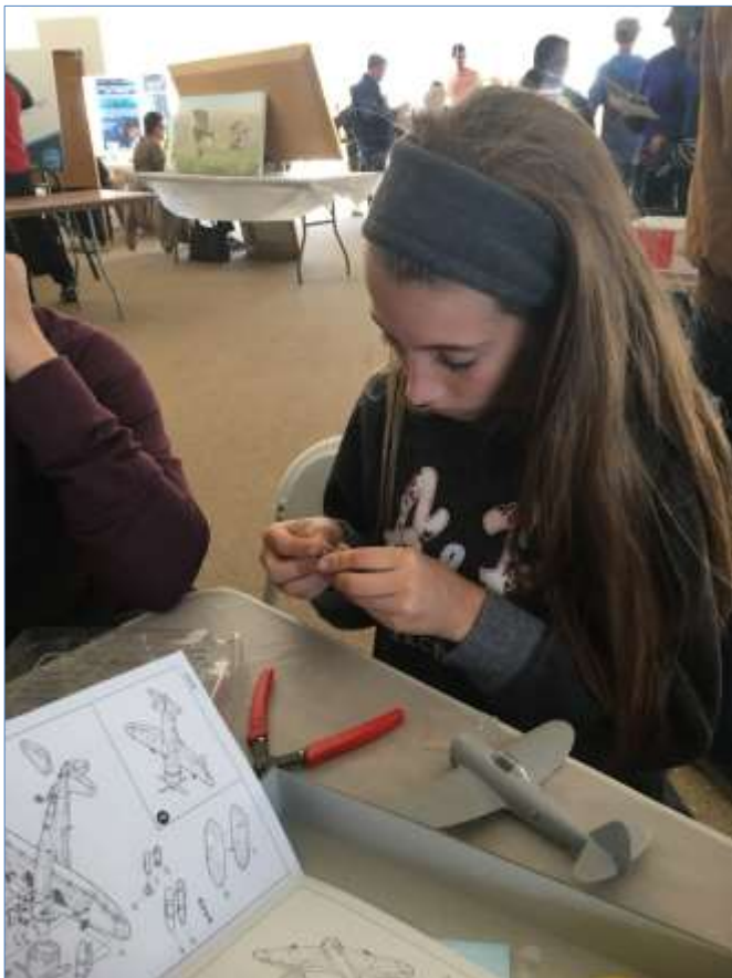
The engine – cowling assembly getting some attention. 2017 © Frank Landrus