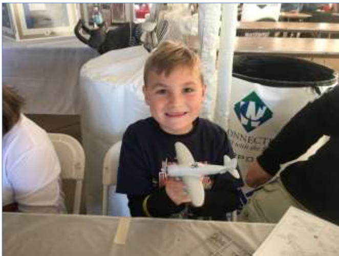
This young man is excitedly showing off his Thunderbolt. 2017

While we normally limit the builders to less than age 16, it is really not too tough to accomplish that as few 16 year old children want to sit down with their parents for thirty to forty minutes (although it has happened on occasion). We really do not have a younger age limit, where the limitation is generally dexterity and attention-span. However, I have witnessed some three year olds (claimed anyways) assemble simple kits (the old Testors / Hawk kits from the late fifties).