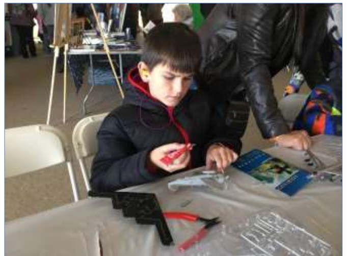
This young man is applying tube glue to his kit. While tube glue is not ideal, it is much preferable to liquid cement or super glue in this type of setting.