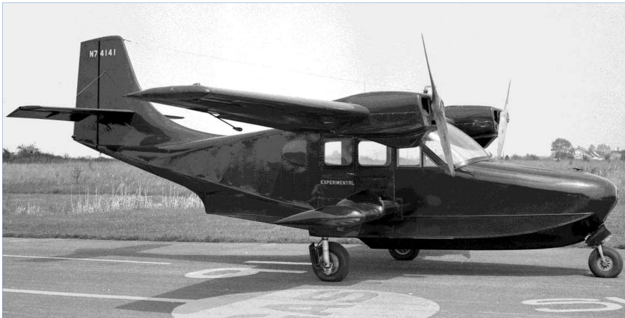
Aquaflyght W-6 Aqua 2, N74141.