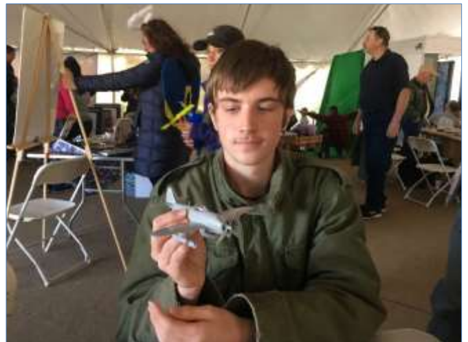
This fifteen year old lad finished his Republic P-47D 2017