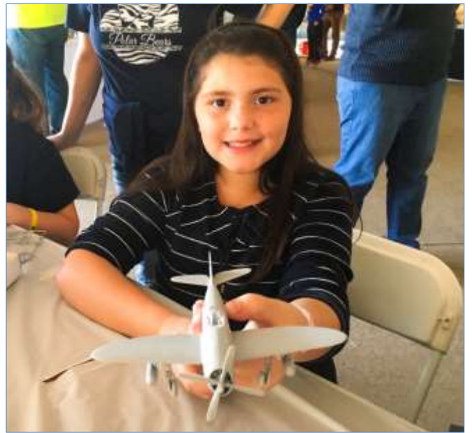
This young lady is proudly showing off her Thunderbolt. 2017 © Frank Landrus