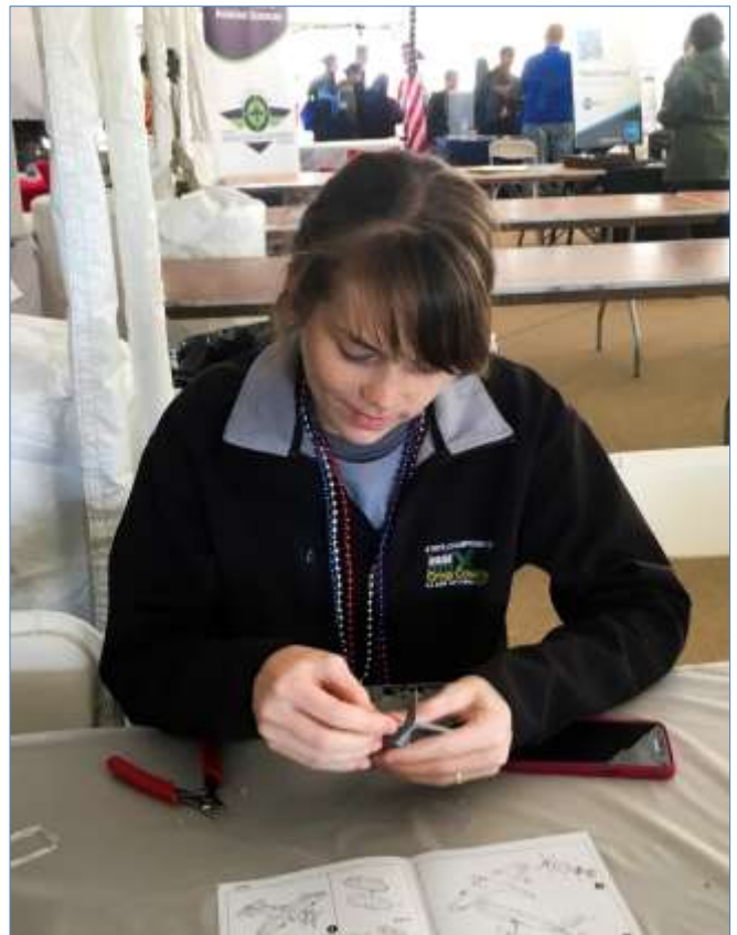
This 15 year old young lady patiently assembled her Republic P-47D Thunderbolt.

The sad part was many kids walked away because their parents did not wait for an open spot, and they did not come back later. That being said, our volunteers were clearly maxed out trying to support the multiple builds going on at any given time. The only real break we got was when the Blue Angels went airborne at 4 pm and nearly everyone went to see their exciting performance.