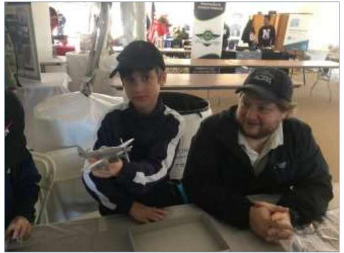
Another proud father looking on at his son's finished Republic P-47D Thunderbolt.

You may ask, why do we insist on parental attendance? It comes from lessons learned after doing Make-N-Takes since 1985 (I was actually the IPMS National organization's Make-N-Take coordinator for West of the Mississippi for some time). First off, you do not want to be a baby sitter for the parents. If you do so, there is no guarantee the parents come back by the time the child has finished his model. Ask me how I know. Second, although our primary interest is in getting children involved in modeling, it will not happen without their parents support, especially the younger children. Third, this activity works well to form a parental – child bond. Most kids simply will not develop an interest in modeling if their parents don't care and support it. Finally, there is a safety issue. We do offer goggles, but they are not popular with the children. We are working with glues that do have some toxicity...and don't get me started on non-toxic glues.