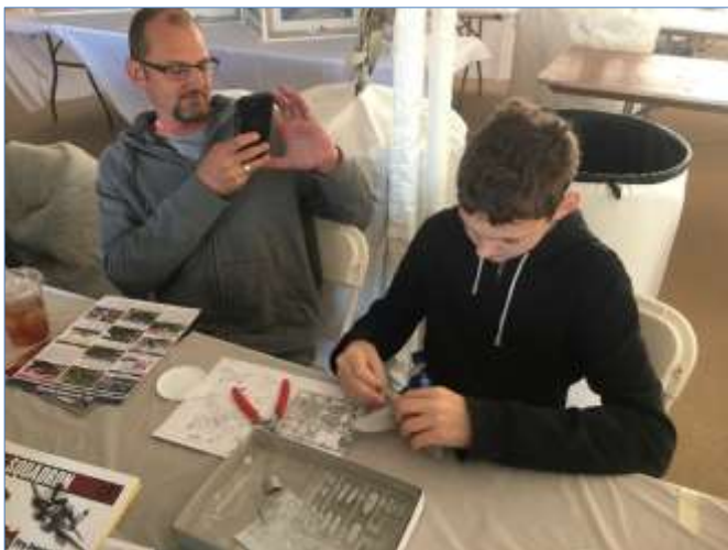
This young man is gluing the engine / cowling assembly to the nose of his Republic P-47D Thunderbolt while his proud dad takes the photograph.