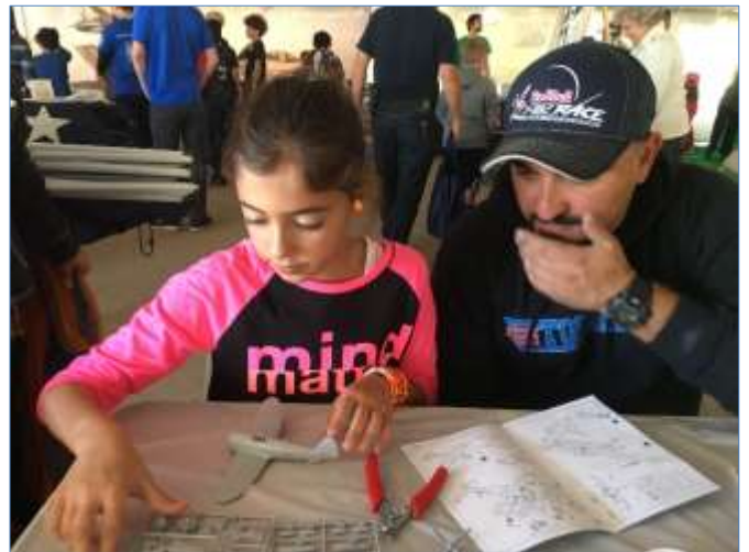
This dad is clearly interested in his daughter's build.