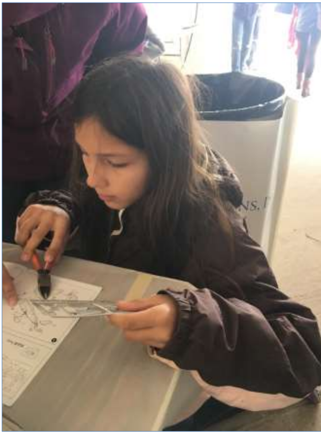
This young lady is trying to follow her mother's instructions on how the kit is assembled. Note the industrial side snips.