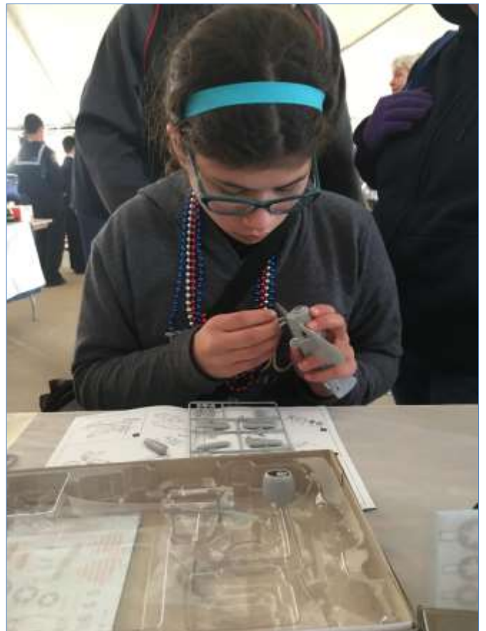
This young lady is seriously engaged in test fitting.