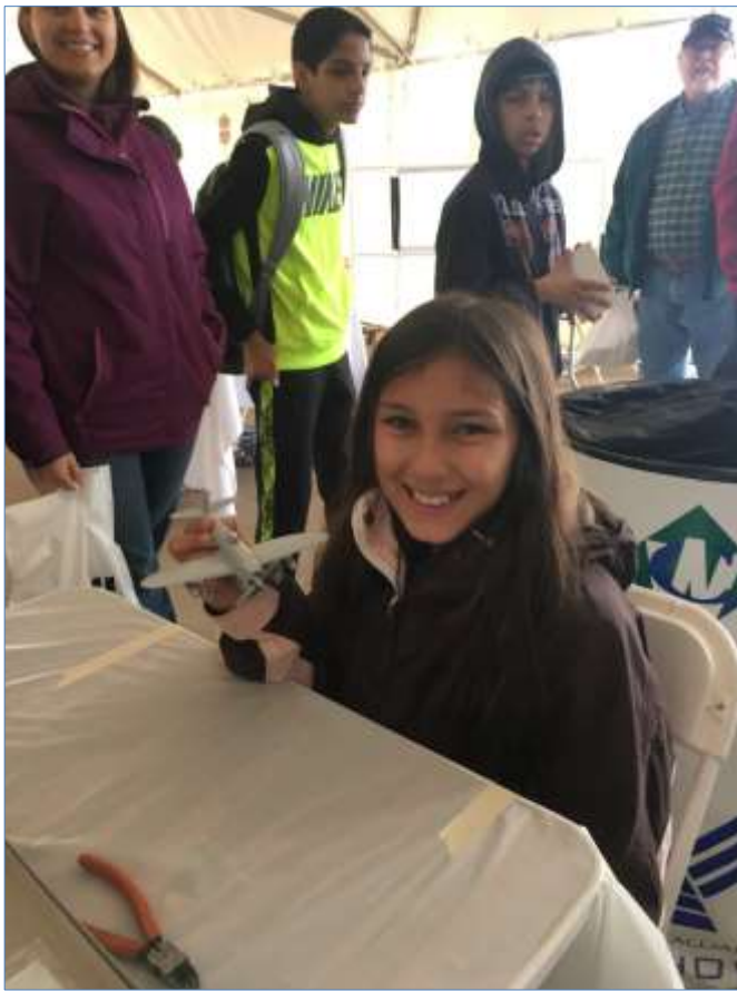
This young lady is proudly showing off her finished Republic P-47D Thunderbolt.

The sad part was many kids walked away because their parents did not wait for an open spot, and they did not come back later. That being said, our volunteers were clearly maxed out trying to support the multiple builds going on at any given time. The only real break we got was when the Blue Angels went airborne at 4 pm and nearly everyone went to see their exciting performance.