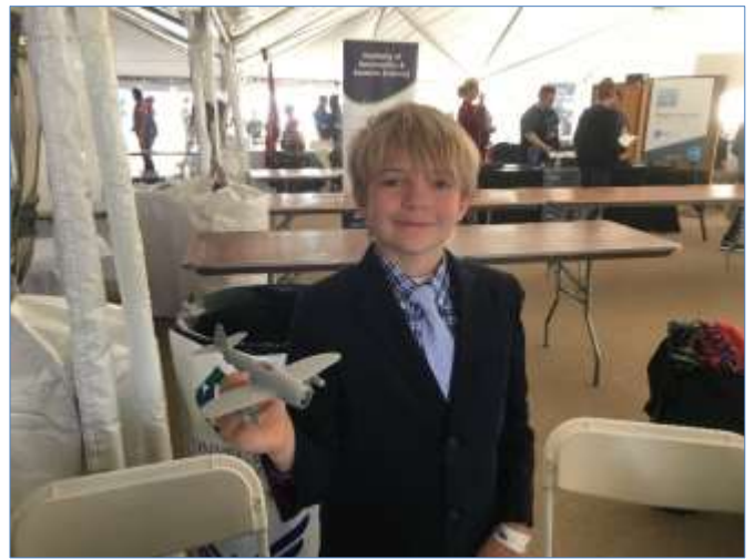
This was a new one for me. I've seen young men dressed in coat and tie for church, but not for an Airshow. It didn't slow him down from building his Thunderbolt though.