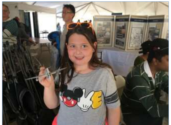
This young lady is another satisfied customer!