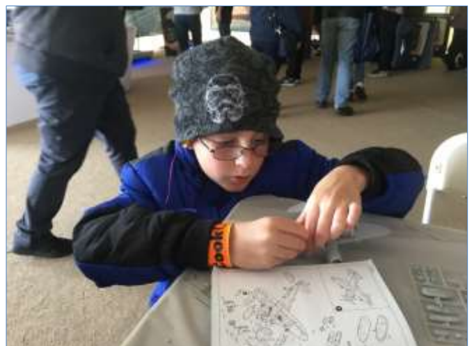
This young man is focused on test fitting the main landing gear strut on his Republic Thunderbolt.