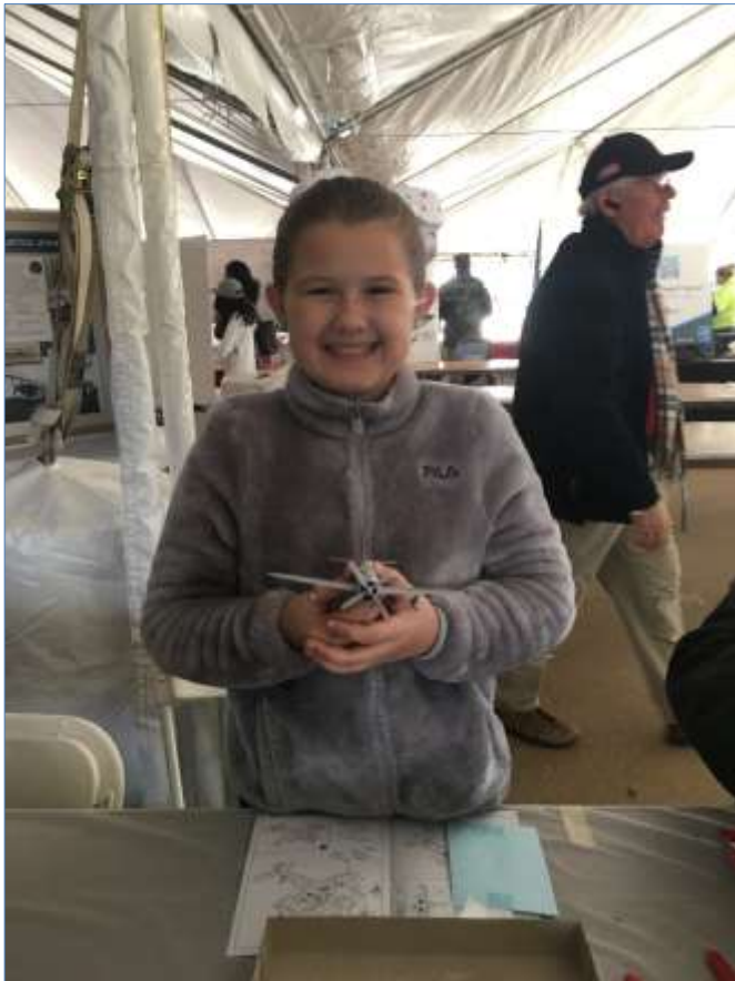
This young lady is proudly showing off her Thunderbolt. 2017