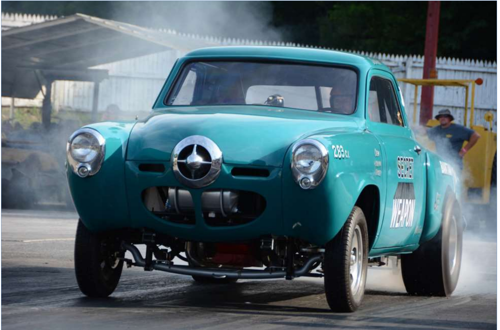
1951 Studebaker Business Coupe C/G, "Secret Weapon", restoration