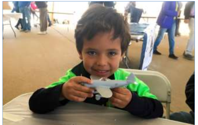
This young man is proudly showing off his Thunderbolt. 2017 © Frank Landrus

We discovered early on that the non-toxic glues, notably the 'blue' tube glue works very poorly on plastic models. The last thing you want to do when introducing kids to modeling is to make it frustrating, and we found out quickly that a glue that does not work will not endear a child to pursue modeling.