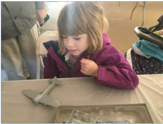
This five year old young lady is waiting for the glue to dry on her Republic Thunderbolt.