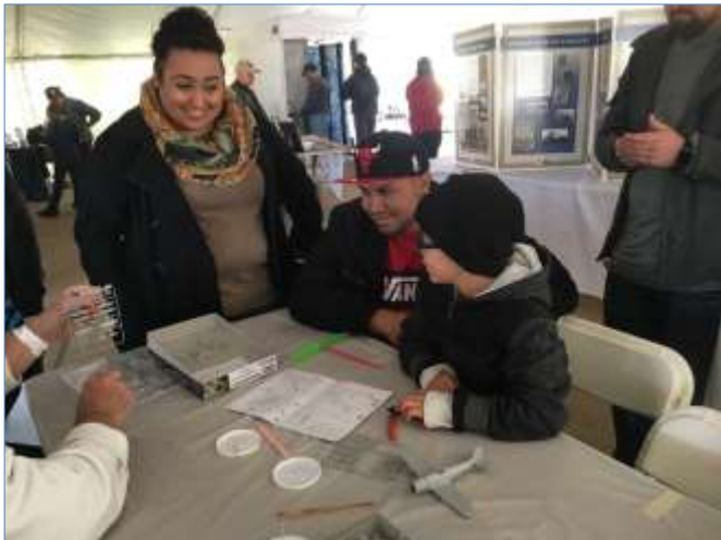
This mother and father are clearly enjoying watching their son build a Republic Thunderbolt.

The sad part was many kids walked away because their parents did not wait for an open spot, and they did not come back later. That being said, our volunteers were clearly maxed out trying to support the multiple builds going on at any given time. The only real break we got was when the Blue Angels went airborne at 4 pm and nearly everyone went to see their exciting performance.