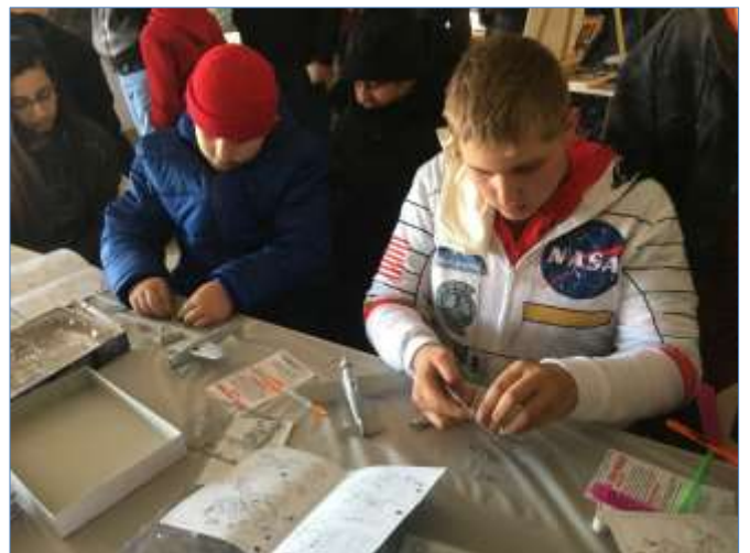
Proof that modeling 'Is Rocket Science' as two young men assemble their Hobby Boss 1/72 Republic P-47D Thunderbolts 2017