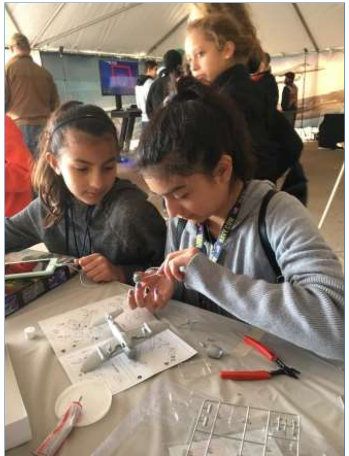
This young lady is being carefully watched by her sister. 2017 © Frank Landrus