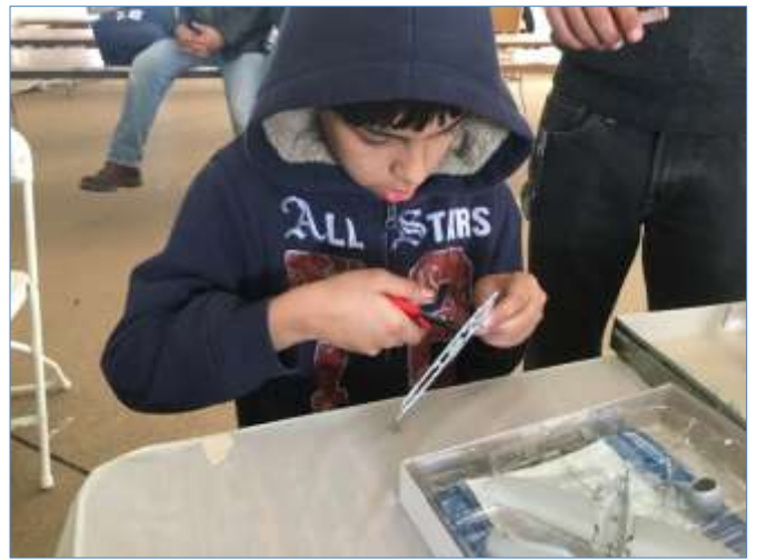
This young man is showing off his side snip technique in separating parts from the sprue for his Republic P-47D Thunderbolt. 2017 © Frank Landrus