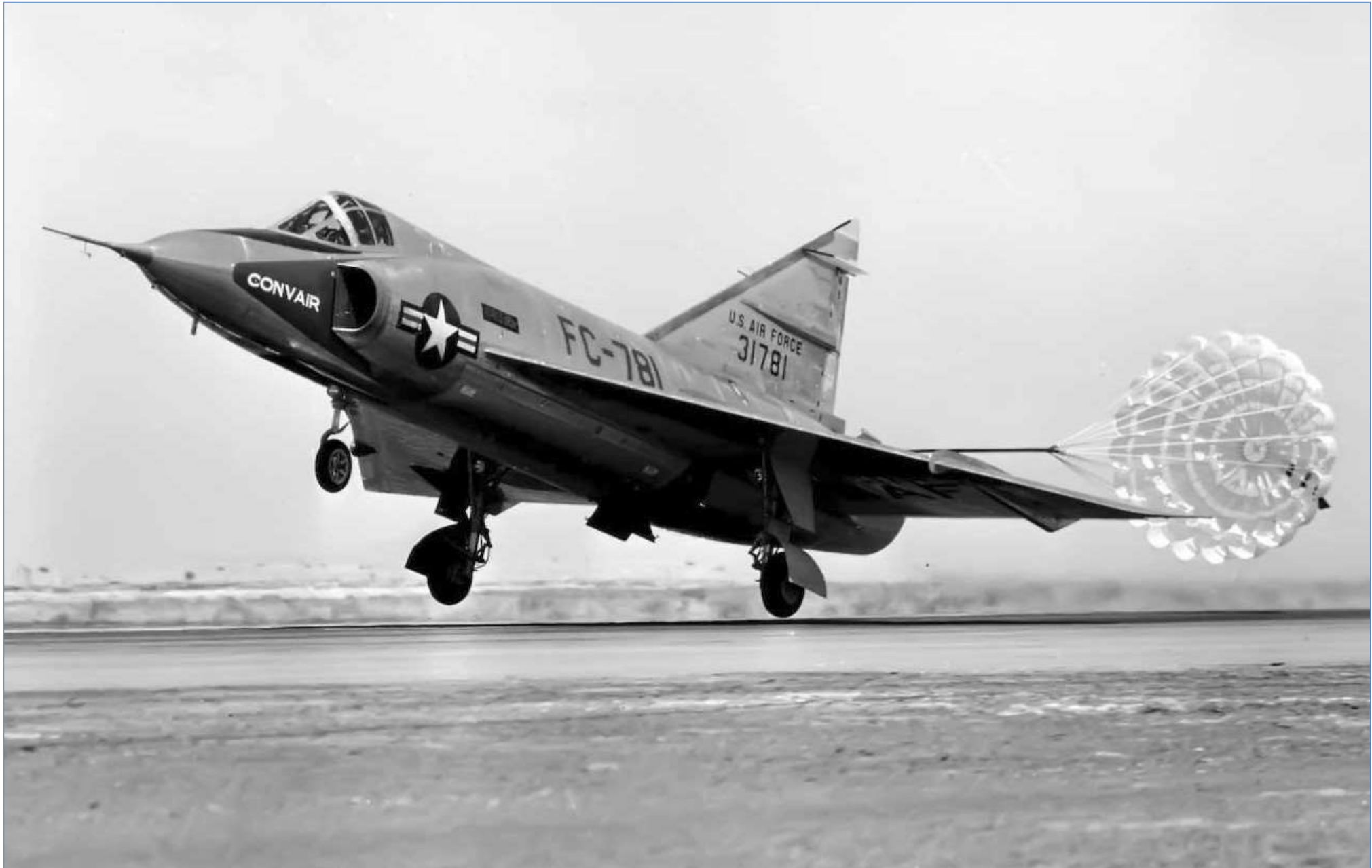
Convair YF-102 (SN 53-1781) landing with drag chute