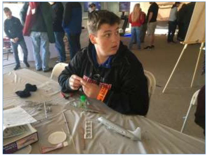
This young man wanted a more challenging kit and grabbed a Glencoe Models 1/96 Vickers Viscount.