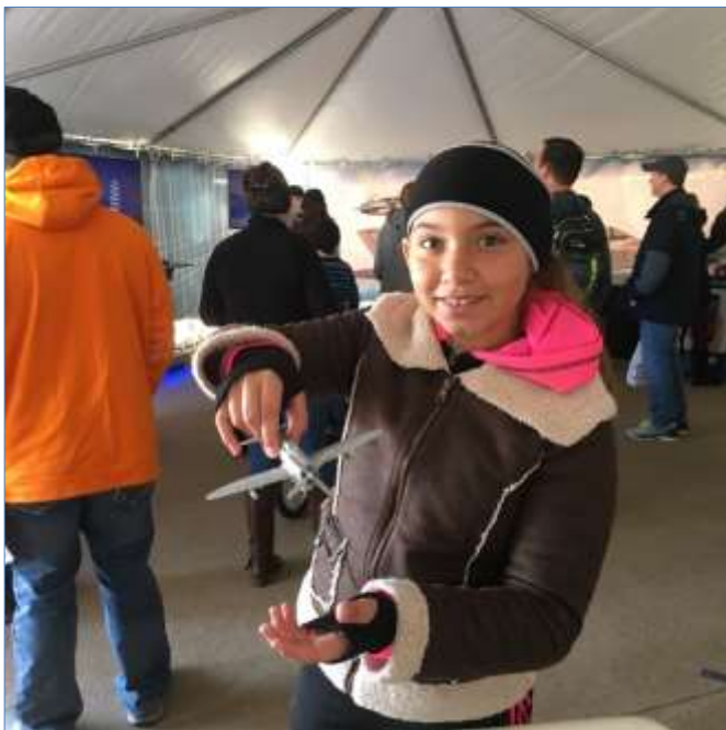
This young lady is proudly showing off her Thunderbolt.