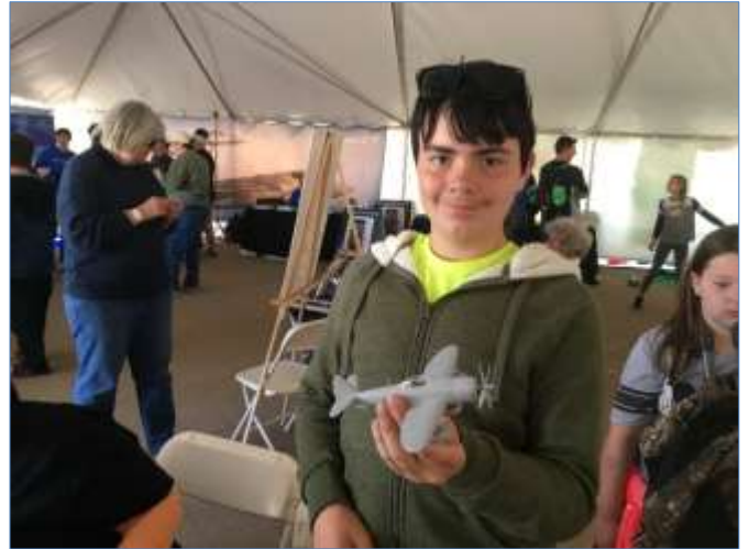
This young man is proudly showing off his Thunderbolt. 2017